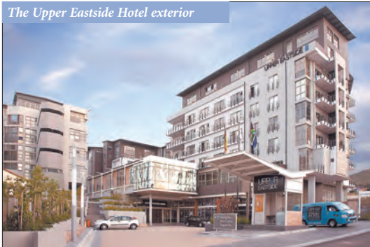
The Upper Eastside Hotel exterior

www.usb.ac.za/coaching +27 (0)21 918 4246